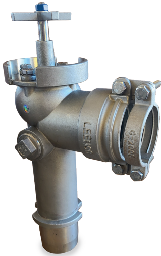
Shown with (X-TOP) option